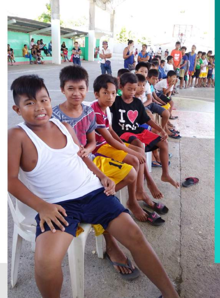
Free circumcision (Operation Libreng Tuli ) was held in Batangas and Aklan

Brgy. Pawa, Nabas, Aklan (May 19, 2018) Brgy. Rizal, Nabas, Aklan (May 19, 2018) Brgy. Unidos, Nabas, Aklan (May 19, 2018) Brgy. Napaan, Malay, Aklan (May 19, 2018)